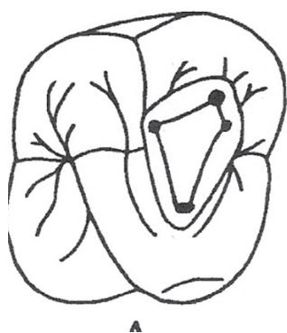
Fig. 2 Modified, rhomboidal access cavity.