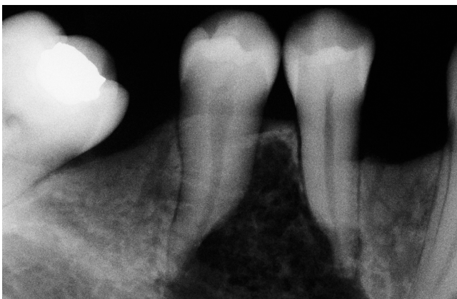
Fig. 2 Periapical radiography showing root resorption in more detail and widening of the periodontal ligament space of neighboring teeth. Note the absence of the distal lamina dura in the right mandibular in both premolars teeth.

of the cytological findings and clinical and radiographic data. An incisional biopsy was therefore performed, which revealed a bimorphic pattern with focal areas of relatively mature cartilage formation and other areas of highly cellular tissue composed of small round or spindle-shaped cells (Fig. 3C). A prominent hemangiopericytoma-like pattern with numerous capillary channels was evident. Areas of calcification were also identified. A diagnosis of mesenchymal chondrosarcoma was established. The patient underwent radical resection of the mandible. The resected tumor specimen showed predominant cartilaginous component. No tumor tissue was detected in regional lymph nodes. The patient is free of disease 3 years after treatment.