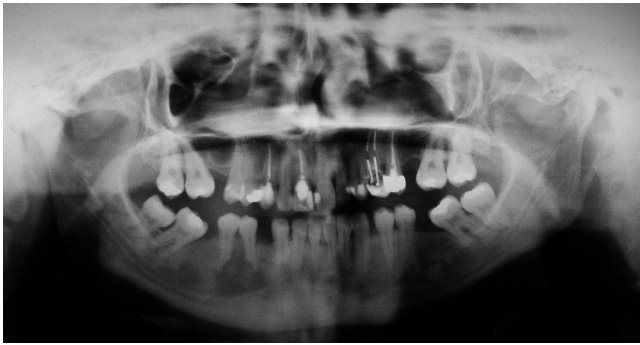
Fig. 1 Panoramic radiography revealing an ill-defined heterogeneous radiolucency between the premolar teeth in the right mandible. Note root resorption of neighboring teeth.

We were suspicious of chondroid malignancy on the basis