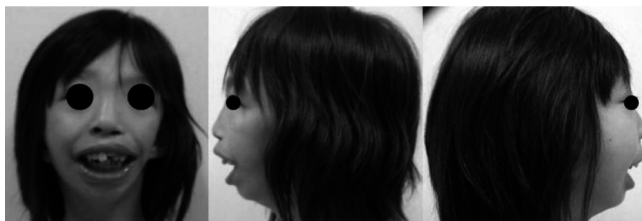
Fig. 1 Frontal, left, and right extraoral views of case 1.

Cephalometric analysis revealed a convex skeletal profile with an increased mandibular plane (SNA: 70°; SNB: 60°; ANB: 10°), severe Class II malocclusion, and a mandibular retrusion (Table 1).