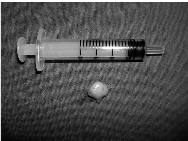
Fig. 3 Pathological specimen after excisional biopsy.

mucosa, with no signs of ulceration or infection. The mass was well demarcated from the surrounding area, mobile but non-pedunculated, soft in consistency, elastic, fluctuant and non-tender (Fig. 1). Extraoral examination revealed no asymmetry or lymphadenopathy. Panoramic radiograph did not show the presence of any pathological change of the jaw structures (Fig. 2). Under local anesthesia, an excisional biopsy of pathological mass in the left buccal mucosa, by conventional scalpel surgery, was performed (Fig. 3). The wound was covered with an iodine bandage. The surgical specimen was fixed in 10% buffered formalin and submitted for histopathological evaluation, with a provisional clinical diagnosis of lipoma. Seven days after surgery, the patient came for review. Healing of the wound was uneventful.