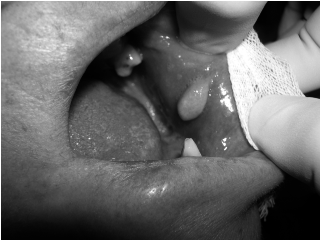
Fig. 1 Clinical appearance of the pathological mass on the left buccal mucosa. The lesion had been present for 20 years.