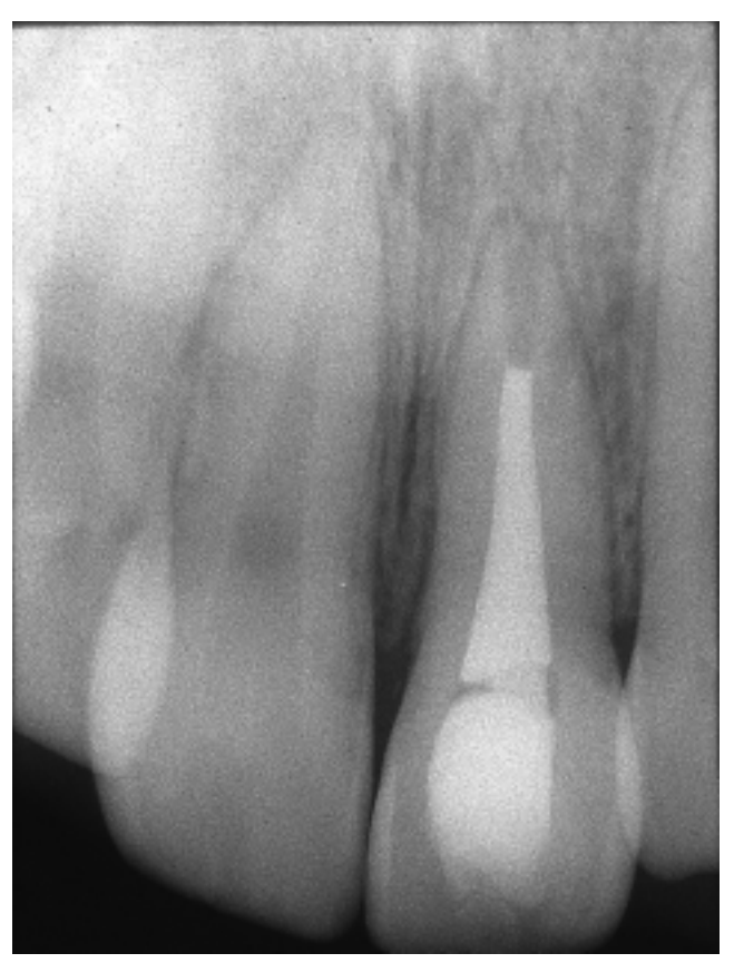
Fig. 2 Root canal filling.