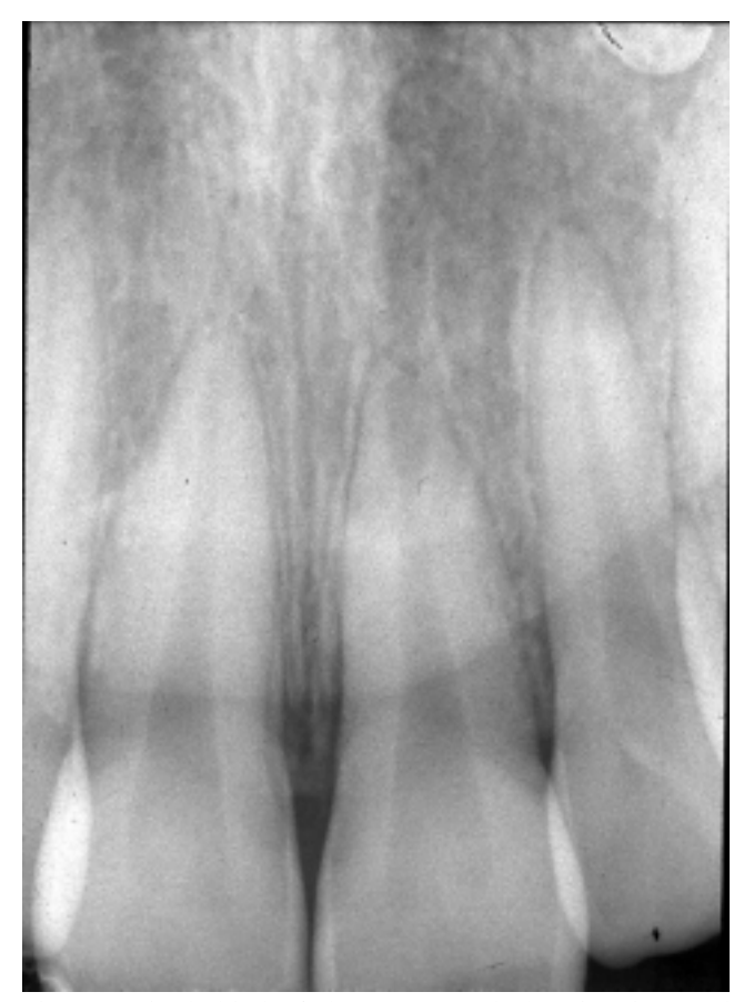
Fig. 1 Apical third of the root canal showing internal resorption.

enlargement of the resorptive area, the first step of treatment planning was root canal treatment followed by periapical surgery, including apicoectomy with retropreparation followed by retrograde filling. This protocol was approved by the institutional ethics committee and free and informed consent was obtained from the patient. An access cavity preparation was created exposing the necrotic pulp tissue. Root canal preparation was undertaken up to approximately 6 mm short of the radiographic apex, given the impossibility of creating a satisfactory apical stop to engage the principal gutta-percha cone. Thus progressive cleaning and shaping of the root canal up to a Kerr #90 file was done, followed by step back preparation with the use of Gates-Glidden drills #4, 5 and 6, and irrigation with 1% sodium hypochlorite. In this segment of the root canal there was pulp hemorrhage. After removal of the smear layer, root canal sealing was done using gutta-percha cones plasticized with heat, rolled and molded in the root canal, associated with cement Sealer 26 (Dentsply Industria e Comércio Ltd, Rio de Janeiro, Brazil), using the thermomechanical compaction technique, followed by coronal sealing (Fig. 2).