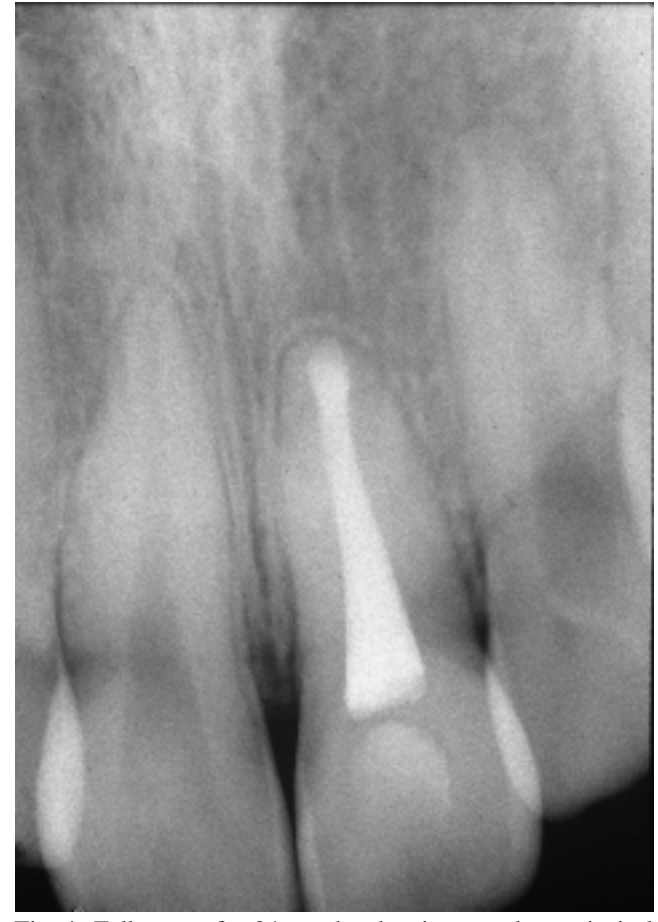
Fig. 4 Follow-up after 24 months, showing complete periapical repair with formation of a continuous lamina dura.

However, when there is communication between the pulp cavity and the periodontal space due to internal resorption, the use of calcium hydroxide before root canal filling